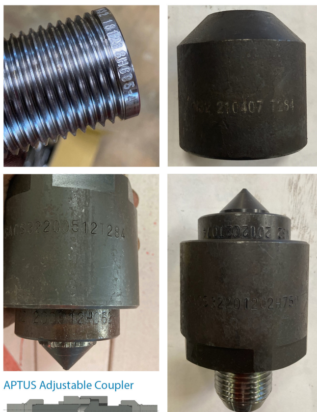
APTUS Adjustable Coupler